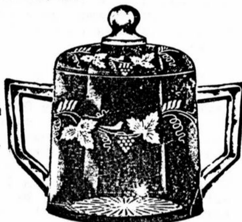
No. 2590—Pullman Shape. Handled Sugar and Cover. White Enamelled Grape Vine Decoration Line.

If you have not had our Lamp and Tableware Assortments we shall be pleased to send you at once illustrations with prices.