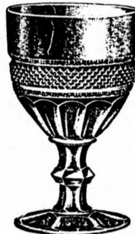
9 oz. Goblet. No. 2719—La Touraine.

The Cambridge Glass Co., CAMBRIDGE, OHIO, U. S. A., Manufacturers of