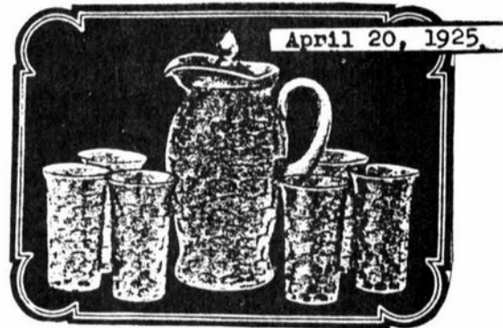
A Refreshment Set in Block Optic

The Cambridge Glass Co., 184 Fifth avenue, has added a great array of new things since my last visit. There are six new patterns in gold encrustation on their colored glass, all of it in a rather lacy effect, which is much more interesting than the solid bands. There is a new cocktail set made in amber