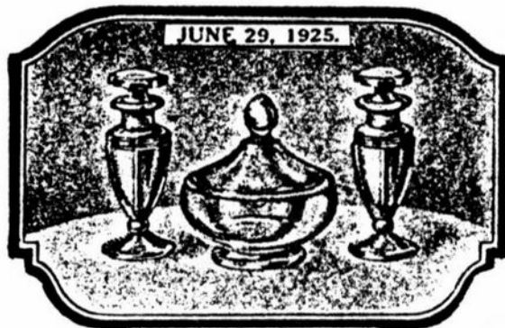
No. 349/159 Three-Piece Vanity Set.

Furnished in Crystal, Amber, Emerald, Mulberry and Blue. By far the best set on the market today.