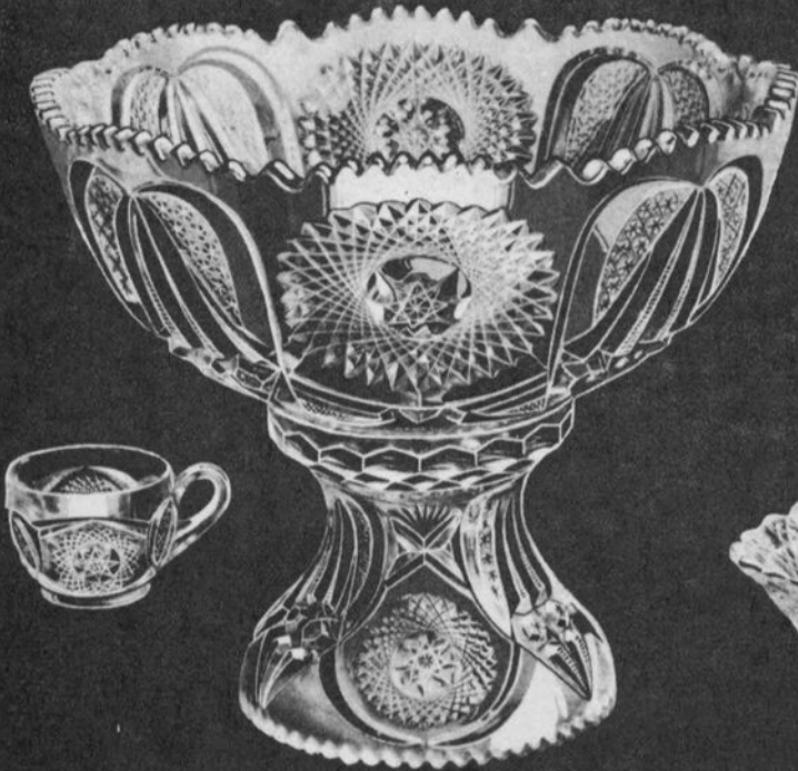
2631—15 pc. Punch Set 1—No. 2631—15 in. Bowl & Foot (9 qts.) 12—No. 2631—5 oz. Cups 1—No. 1402/111—Ladle