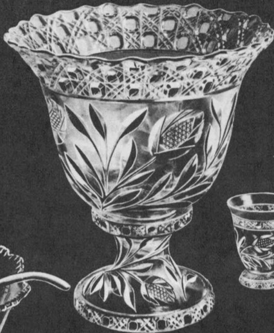
3200—15 pc. Punch Set 1—No. 3200—12½ in. Bowl & Foot (6 qts.) 12—No. 3200—5 oz. Cups 1—No. 1402/111—Ladle