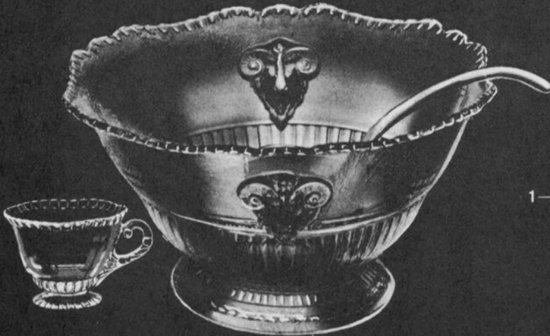
3500 Gadroon—15 pc. Punch Set 1—No. 3500/119—13 in. Bowl (5 qts.) 12—No. 3500/1—5 oz. Cup 1—No. 485—Ladle 1—No. 1402/29—17½ in. Plate