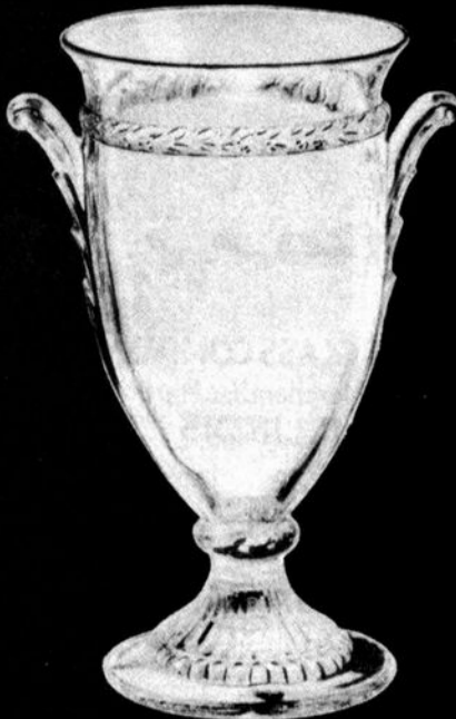
3500/45 10 In. Ftd. Vase $29.70 Doz.