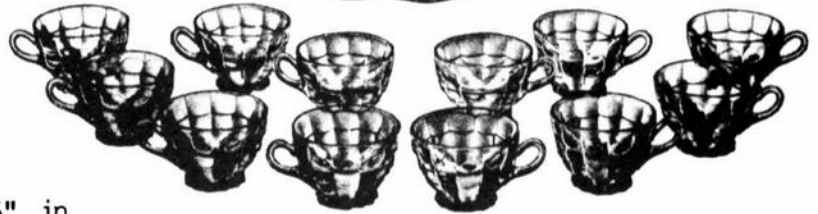
478/479/488/216 16 Pc. Punch Set With Chrome Ladle