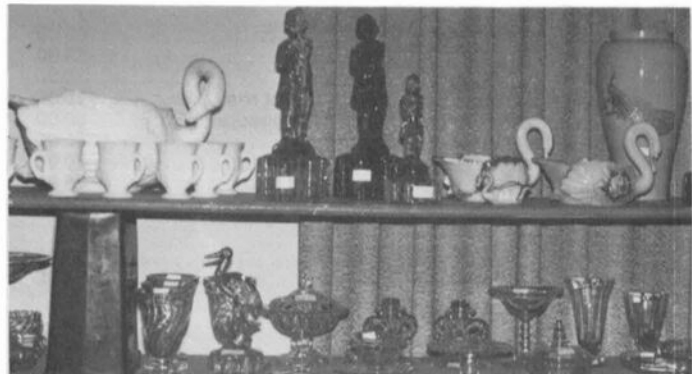
THE SHOW ROOM WAS ELEGANT