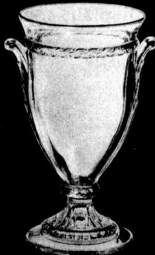
3500/44 8 In. Ftd Vase $15.00 Doz.