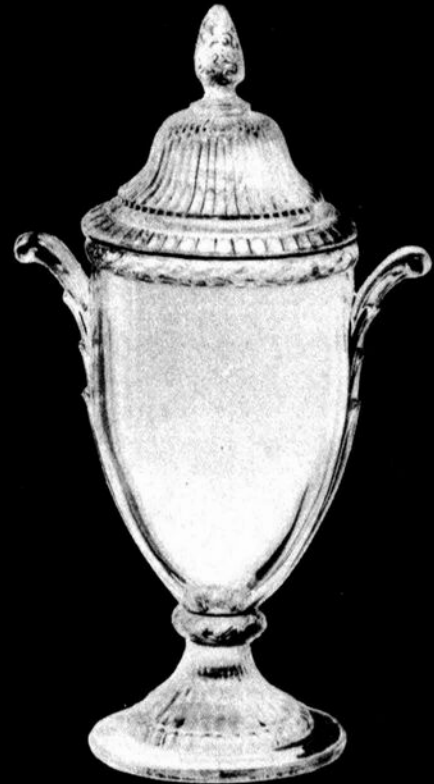
3500/42 12 In. Cov'd. Urn $33.00 Doz.