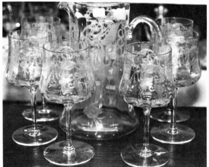
Etched MARJORIE Water Set