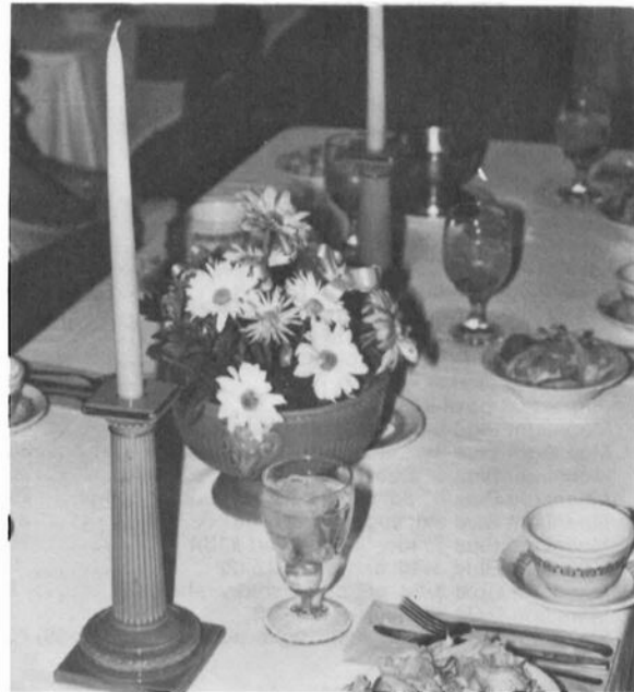
THE BANQUET TABLES WERE LOVELY