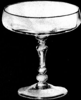
3500/101 5 1/4 In. Comport, Blown $19.80 Doz.