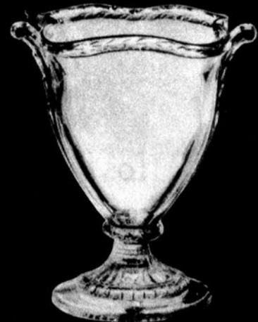
3500/122 - 7 In. Vase $12.40 Doz. Also 3500/123 - 8 In. Vase $24.75 Doz.

The prices shown are list prices subject to your usual discounts.