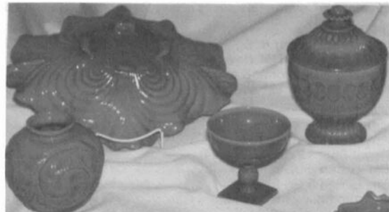
THE DISPLAY ROOM WAS A DELIGHT