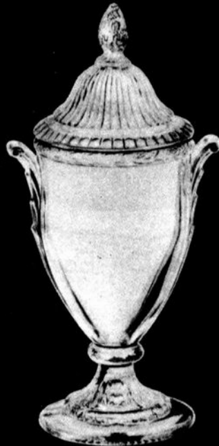
3500/41 10 In. Cov'd. Urn $18.00 Doz.