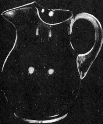
77—76 oz. Jug, Ice Lipped