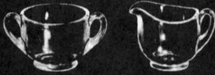
253—Individual Sugar & Cream