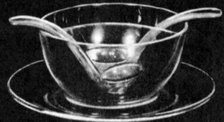
288—5½ in. 4-pc. Twin Salad Dressing Set