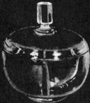
307—6 in. 3 part Candy Box & Cover