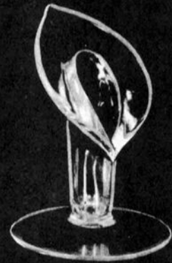
499—6½ in. Calla Lily Candlestick