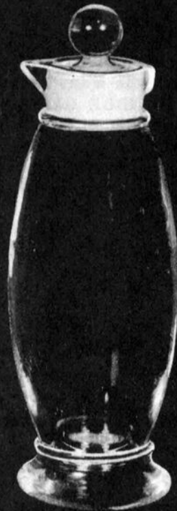
102—48 oz. Cocktail Shaker Pat. No. D-133,198