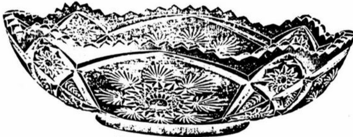
Nappy, D Shape or Flared. 9 \frac{1}{4} inch, actual measurement. Packed 5 dozen in a barrel.