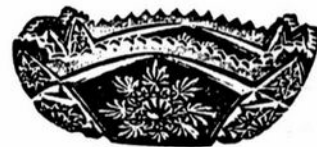
Nappy, Square. 4 \frac{1}{4} inch, actual measurement. Packed 22 dozen in a barrel.