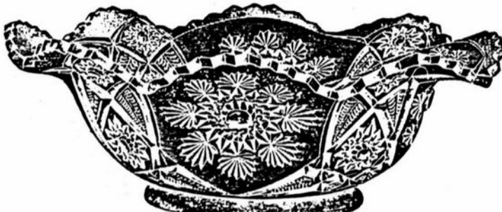
Nappy, E Shape or Flared and Crimped. 9 \frac{1}{4} inch, actual measurement. Packed 4 \frac{1}{4} dozen in a barrel.