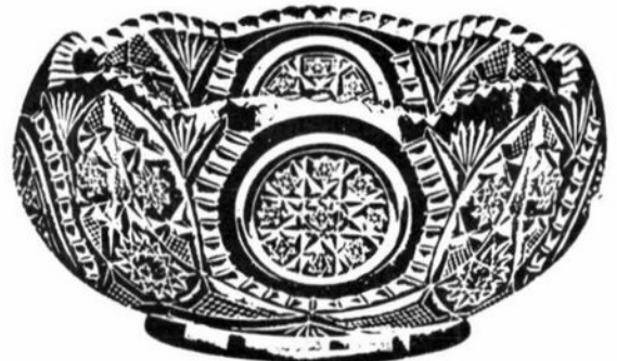
Nappy F Shape.