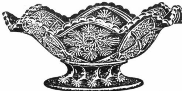
6 Inch Comport, E Shape. Packed 4 1/4 dozen in a barrel.