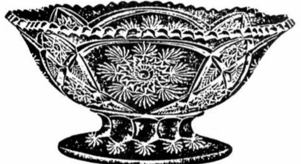
6 Inch Comport, C Shape. Packed 4 1/2 dozen in a barrel. Actual measurement 7 1/4 inches.