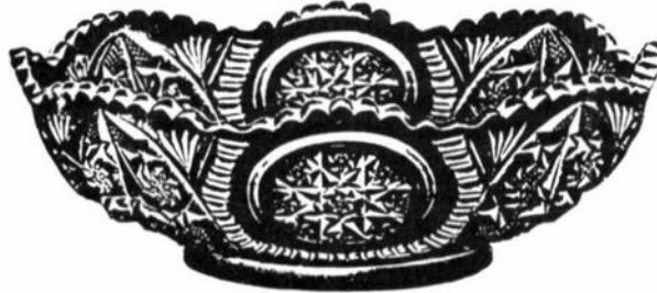
Nappy D Shape.