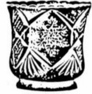
Toothpick. Packed 24 dozen in a Barrel. Packed 12 dozen in a box.