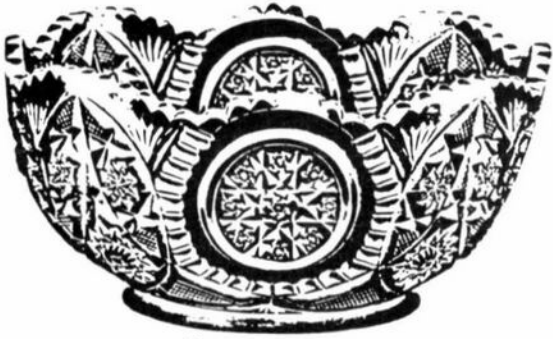
Nappy A Shape.