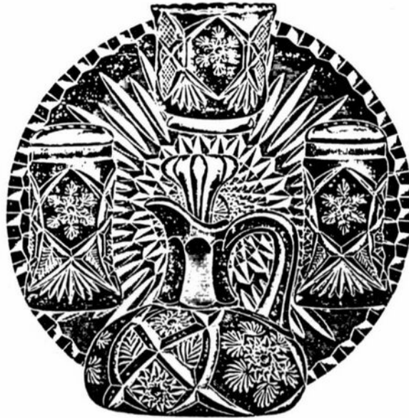
Condiment Set. Packed 2 dozen in a barrel.