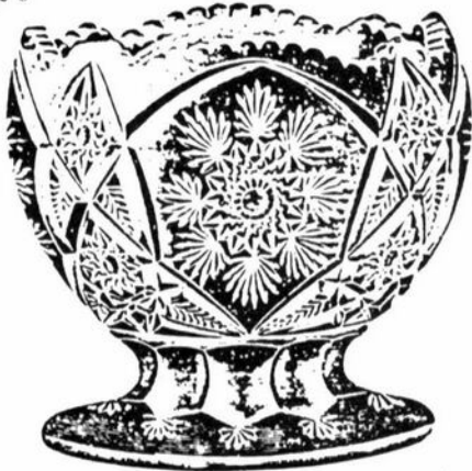
6 Inch Comport, J Shape. Packed 4 dozen in a barrel.