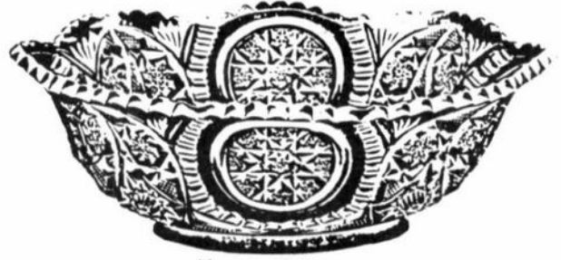
Nappy C Shape.