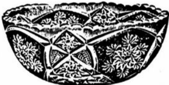
Nappy, Round. 4 \frac{1}{4} inch, actual measurement. Packed 24 dozen in a barrel.