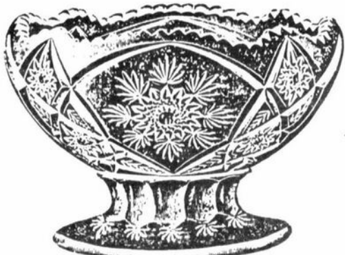
6 Inch Comport, G Shape. Packed 4 dozen in a barrel.