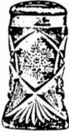
Salt and Pepper. Packed 30 dozen in a barrel. Packed 12 dozen in a box.