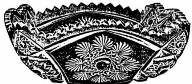
Nappy, Square. 8 inch, actual measurement. Packed 4 dozen in a barrel.