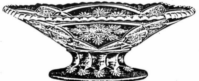
6 Inch Comport, F Shape. Packed 4 dozen in a barrel.