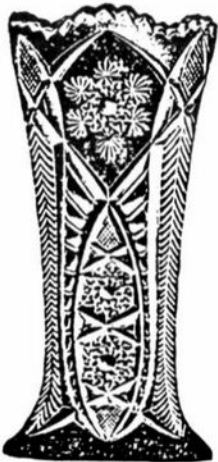
6 Inch Vase. Packed 10 dozen in a barrel.