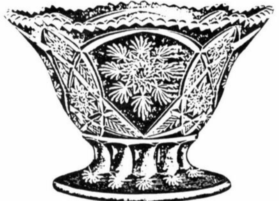
6 Inch Comport, K Shape. Packed 4 dozen in a barrel.