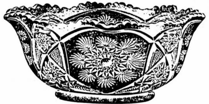
Nappy, B Shape or Crimped. 8 \frac{1}{4} inch, actual measurement. Packed 4 dozen in a barrel.