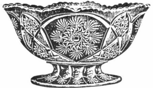
6 Inch Comport, C Shape. Packed 4 1/4 dozen in a barrel.