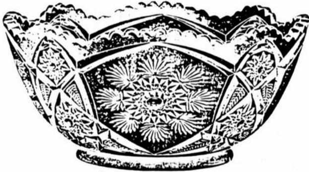
Nappy, A Shape or Round. 8 \frac{1}{4} inch, actual measurement. Packed 5 dozen in a barrel.