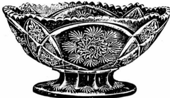
6 Inch Comport, A Shape. Packed 4 1/2 dozen in a barrel.