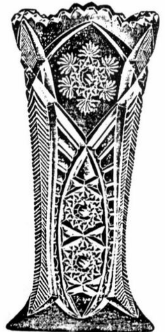
8 Inch Vase. Packed 4 1/2 dozen in a barrel.