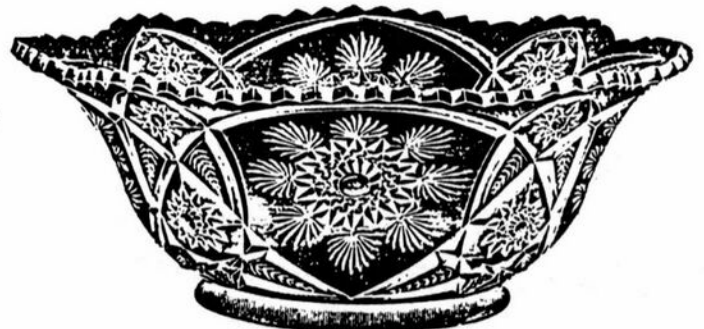
Nappy, C Shape or Belled. 8 \frac{1}{4} inch, actual measurement. Packed 5 dozen in a barrel.