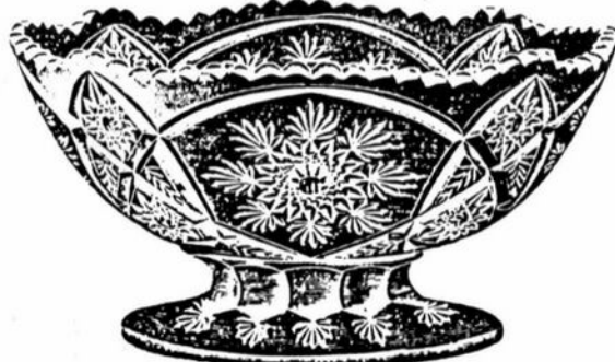
6 Inch Footed Comport, D Shape. Packed 4 dozen in a barrel. Actual Measurement, 7 1/4 inches.