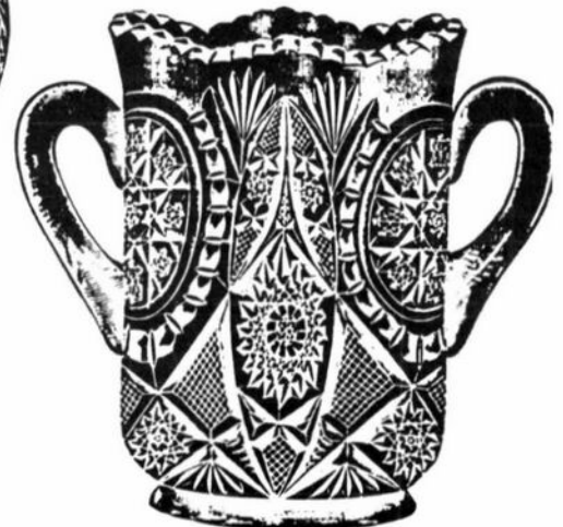
Tall Handled Celery Holder.