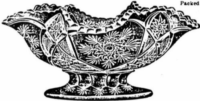
6 Inch Comport, L Shape. Packed 4 dozen in a barrel. Actual measurement 7 1/4 inches.