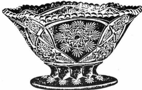
6 Inch Comport, M Shape Packed 4 1/4 dozen in a barrel.