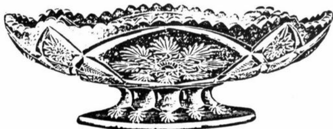
6 Inch Comport, H Shape. Packed 4 1/4 dozen in a barrel.