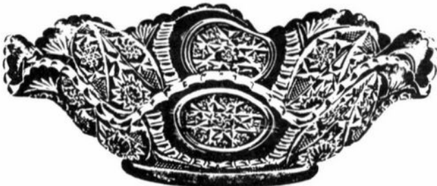
Nappy E Shape.