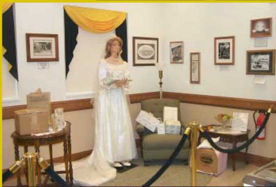
The delightful, new "Cambridge Bride" display, located in the Education Center. The vignette shows a lovely bride unpacking her Cambridge Glass, received as thoughtful wedding gifts. The chair was also manufactured in Cambridge during the same period.

Editor's Note: You may have noticed that this month's issue is only 16 pages, instead of the usual 20. This is an unfortunate reminder of the ongoing shortage of materials for publication. We need research articles, collecting anecdotes, exciting finds... in short, anything of interest to other Cambridge collectors. Please help us out - this is your newsletter. Thank you.