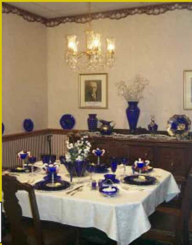
At Right: The 2005 Dining Room Display, including the recently acquired Rosepoint chandelier.