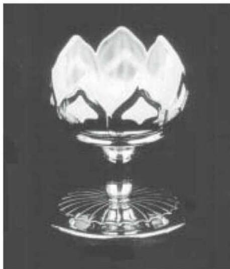
A Farber Comport with a Westmoreland "Lotus" insert.

Bros. pieces were produced by a variety of other prominent elegant glass manufacturers of the time, including Duncan Miller, Heisey, Fenton, Fostoria, Morgantown, New Martinsville/Viking, Westmoreland, and Corning. A cursory review of a