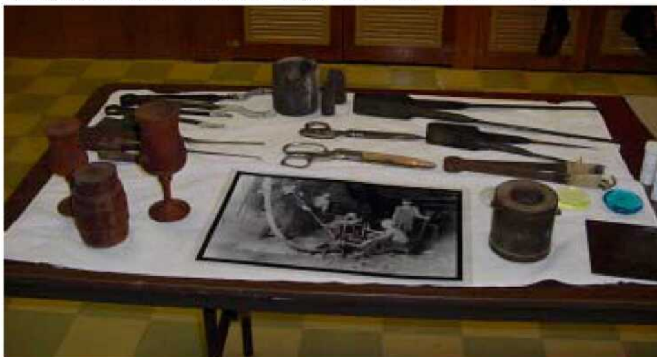
At left: Molds and glassmaking tools fascinated the audience.

There was inspired discussion around the display table after the program. Almost like giving a second program! These folks wanted to know more about the specific pieces of Cambridge glass! It was a wonderful experience to be with this group and share the joy of collecting Cambridge Glass.