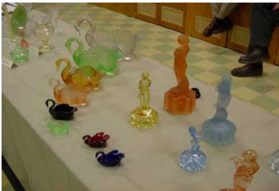
Cambridge Swans and Flower Frogs on display at the March meeting of the Vandalia-Butler Historical Society.