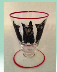
Three Canny Scots 3 oz Canapé tumbler