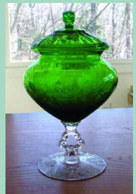
1304 Forest Green Gloria 11” covered urn