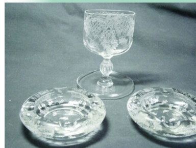
1066 cigarette and 387 ash trays etched Minerva