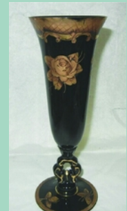
Ebony 10” keyhole with Charleton decoration