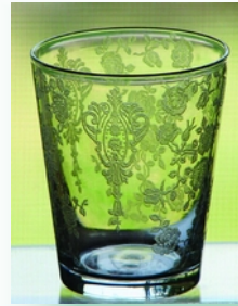
Rose Point #321 2 oz whiskey