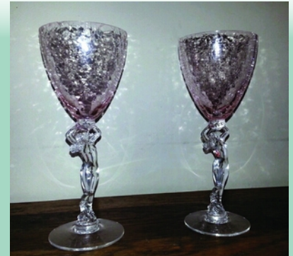
Pink crackle table goblets