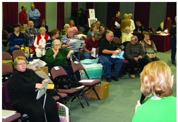
People enjoying the March auction

The committee needs to strictly observe all dates mentioned as we only have a few short weeks to properly inspect, identify, and have a completed auction catalog prepared for the day of the auction. We would like to thank all consignors in advance for their timeliness and adherence to these procedures.