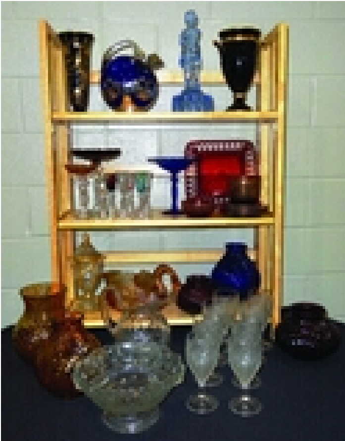
Glass included in the 2013 Museum Forever Raffle.

I'm thrilled I finally joined the NCC and I'm looking forward to attending the events held throughout the year. It's a wonderful organization committed to preserving the work of the Cambridge glass company. It's members are some of the friendliest, most knowledgeable people I've met in a long time.