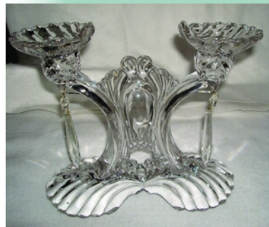
Caprice #69 2 lite Candelabrum with shell bobeches