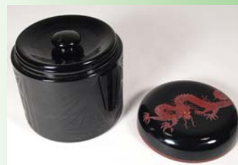
Ebony 882 Tobacco Humidor