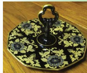
Ebony GE Lorna tray