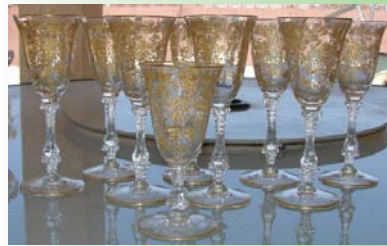
Rose Point GE 3121 Wines