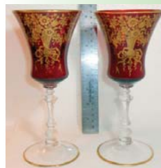
3500 Carmen goblets with D/1037 Gold Overlay