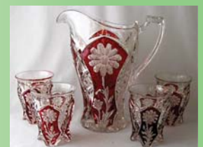
2760 Near Cut Daisy tall tankard with four tumblers