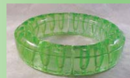
2900 7 in Lt Emerald Flower Circle