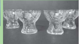
Rose Point 3400/1341 1 oz cordials