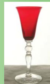
3035 1 oz cordial with Carmen bowl