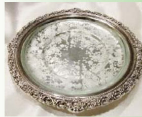
Wilcox Silver Plate trivet with Rose Point insert