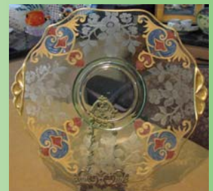
3400/8 Lt Emerald Apple Blossom with GE and Blue and Red enamel