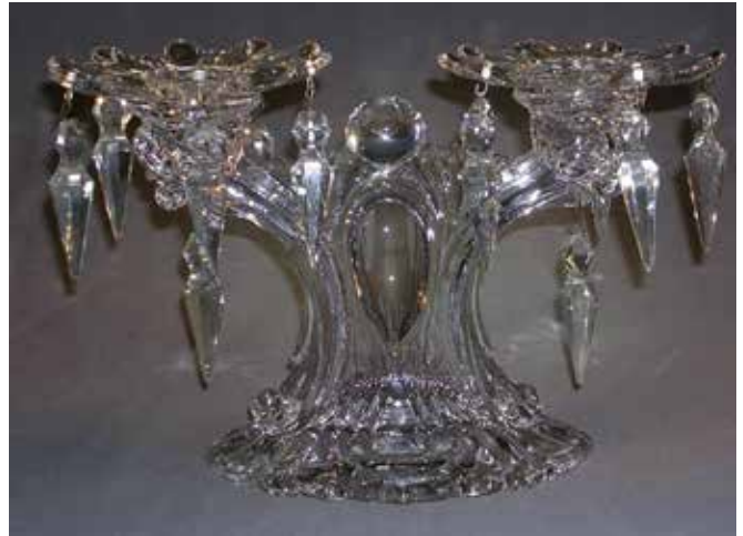
#71 Candelabrum V3

The third version of the #69 candlestick and #71 candelabrum was introduced between 1936 and 1938 discontinued prior to June 1, 1941. Both the candlestick and candelabrum first appear in the 1938-1939 catalog. The mold modifications made to make third version of the #69 candlestick and #71 candelabrum are significant, but they are not as dramatic as the previous change. With the third mold modification, the most significant change is to the central portion of the candlestick where a large sphere of glass was added. In addition, the base was modified to more greatly reflect the Caprice design. Several of the #69 candlestick V3 have been seen in crystal, but much fewer have been seen in Moonlight. I am aware of only one #71 candelabrum V3 in crystal and none in Moonlight. To my knowledge, neither have been seen with the alpine treatment.