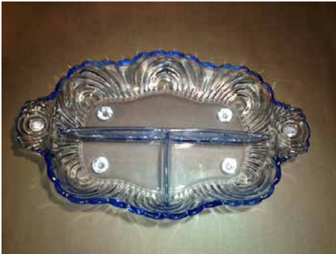
Caprice #125 12" 3-part Celery & Relish, Plain Bottom, Moonlight