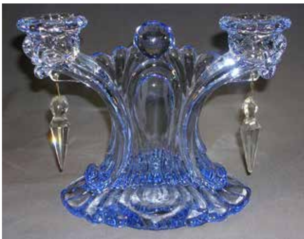
#69 Candlestick (V3)