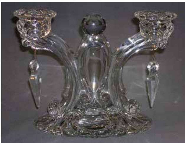
#69 Candlestick V4