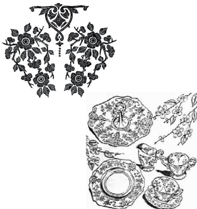
No. 3400 Dinnerware With Apple Blossom Etching "APPLE BLOSSOM is setting THE VOGUE."

Page 31-13 of the 1930-34 catalog reprint is entitled "Silver Decorated Ware." There is no mention of color but since there is duplication of items found in the Ebony/silver encrusted section of preceding pages, these were probably being offered in at least Amethyst and perhaps other colors. An advertisement in the August 1931 issue of Crockery and Glass Journal promotes silver encrusted Apple-Blossom as "offered in a wide selection of table pieces." ■