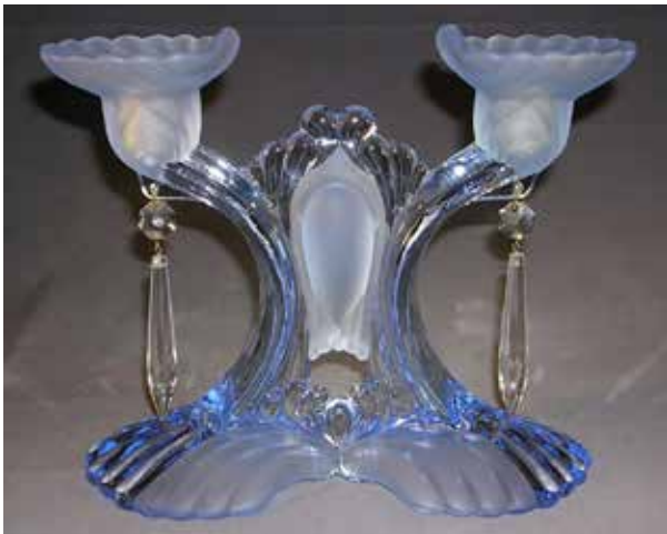
#69 Candlestick (V1) – Alpine