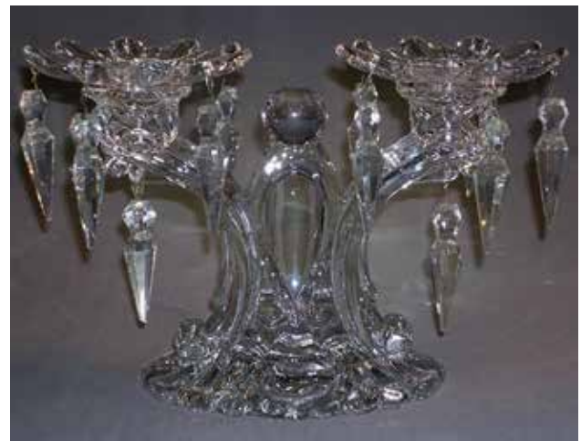
#71 Candlestick V4

The fourth version of the #69 candlestick and #71 candelabrum was introduced between January 1, 1940 and June 1, 1941. Records indicate both items were discontinued by 1945. The final mold modification resulted in