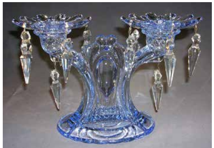
#71 Candelabrum (V2)