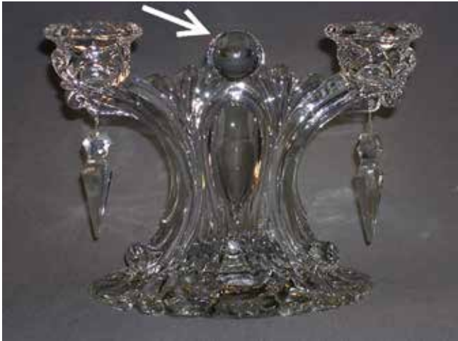
#69 Candlestick V3