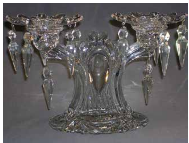
#71 Candelabrum V2