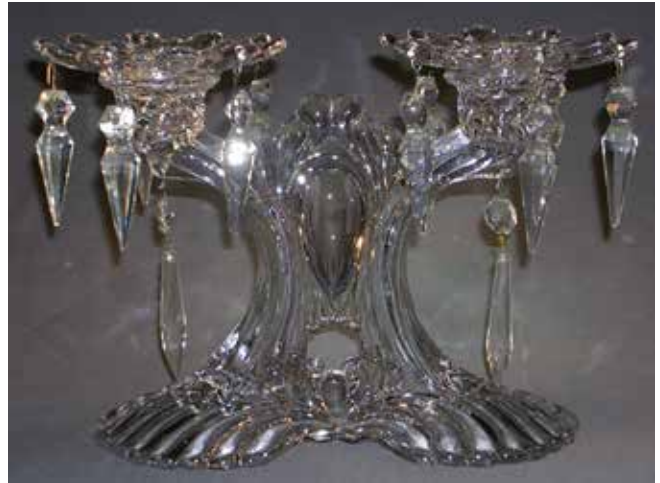
#71 Candelabrum V1

The original #69 candlestick (V1) and #71 candelabrum (V1) were introduced in 1936 and discontinued prior to the printing of the 1938 catalog. Given the limited time of production, many crystal #69 candlesticks (V1) have been seen along with a handful in crystal alpine. A fewer number of Moonlight #69 candlesticks (V1) have been seen with a very limited number in Moonlight alpine. I have only seen one pair of the #71 candelabrum (V1) in crystal and none in Moonlight. Because no catalog photograph exists, I am not certain which bobèche or prism is appropriate for this candlestick. Later versions of the #71 candelabrum are shown with the #23 bobèche and #5 prisms. The candelabrum shown in this photograph was purchased with the #23 bobèches, but no prisms were included.