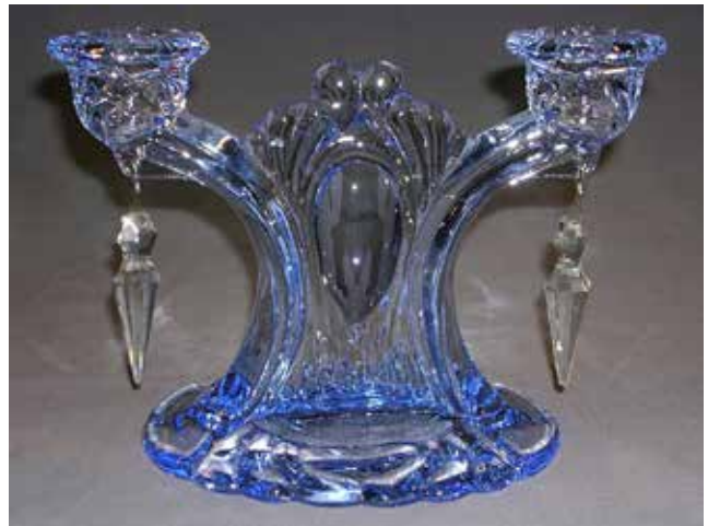
#69 Candlestick (V2)