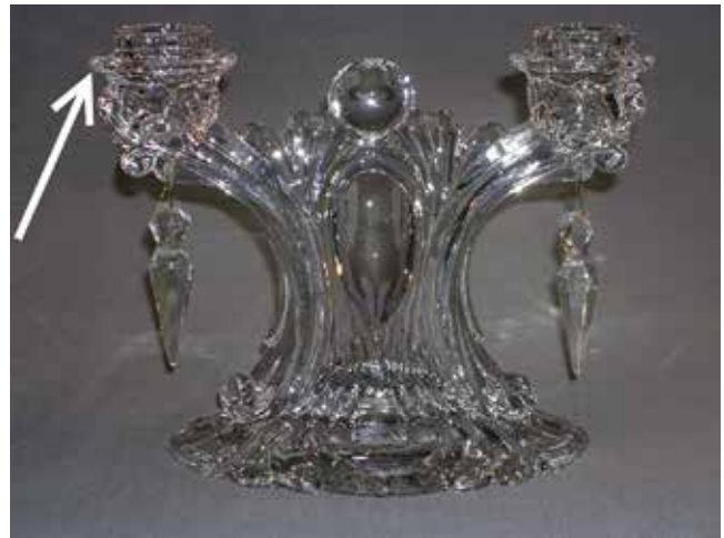
#71 Candelabrum – With Bobèche Collar

The Cambridge Glass Company modified molds all the time. A few years ago, Jack Thompson published a comprehensive article (“The #1338 Candlestick”, Jack Thompson, Crystal Ball, September 2014) on the evolution of the #1338 three-light candlestick. Molds were usually modified because the original mold was too difficult to operate resulting in poor production quality. Over a span of 5 years (1936-1941), the original molds for the #69 candlestick and #71 candelabrum were modified three times. This article will detail the changes after each mold modification.