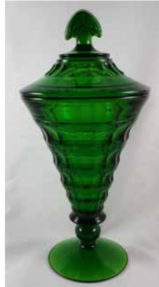
39 - Forest Green Martha Washington 10 in. Covered Urn