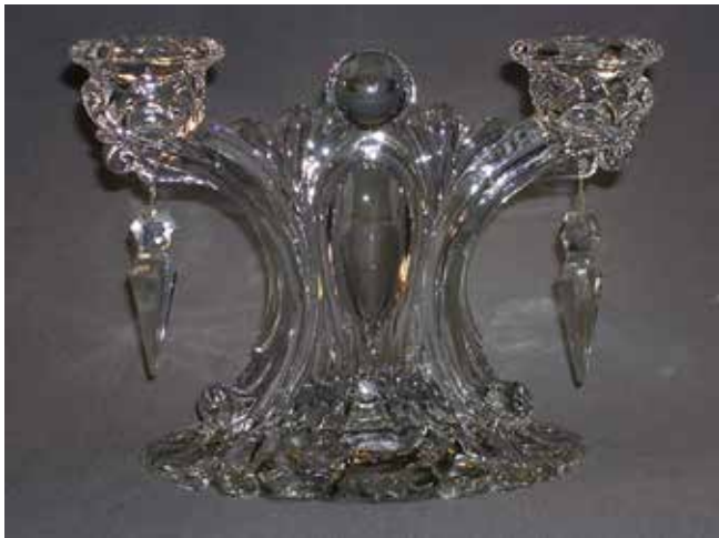
#69 Candlestick – No Bobèche Collar

This article focuses the four variations of the #69 Caprice candlestick and the #71 Caprice candelabrum. A candelabrum refers to a candlestick possessing a bobèche(s). When viewing the photographs, you will see the mold for the #71 candelabrum was created from the #69 candlestick mold by adding a bobèche collar. The price list for the 1940 catalog shows the wholesale price for the #69 candlestick sold for $26.25 per dozen in both crystal and Moonlight, while the #71 candelabrum with included two #23 bobèches sold for $82.50 per dozen. Thus, the wholesale price for a pair of the #69 candlesticks was $4.38 and the #71 candelabrum was a very expensive $13.75.