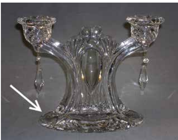
#69 Candlestick V2