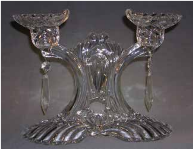
#69 Candlestick V1