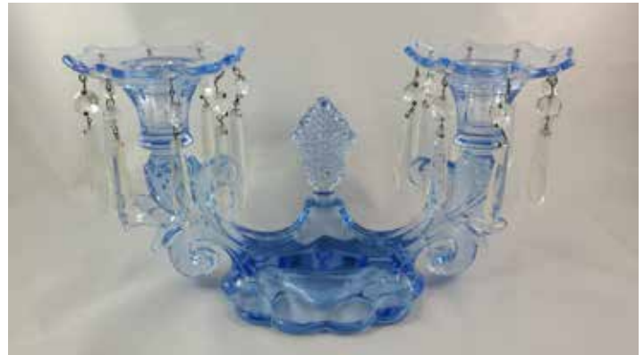
1356 2-light candlelabrum, revised version