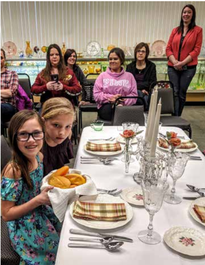
The girls learned how to pass food from the left to the right and that it isn't polite to take a roll from the basket when it is being passed to someone else.