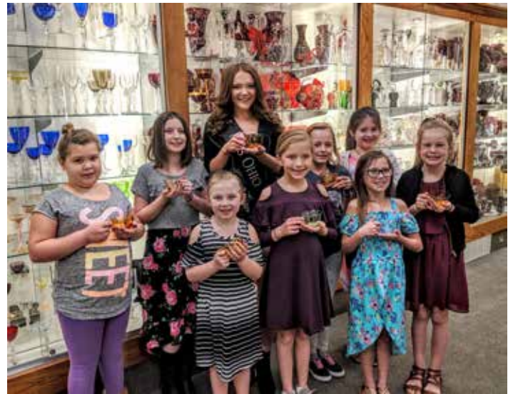
Miss Ohio is surrounded by the Girl Scouts each holding their Cambridge tea cup correctly.