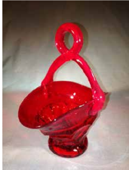
Georgian Carmen basket strange handle