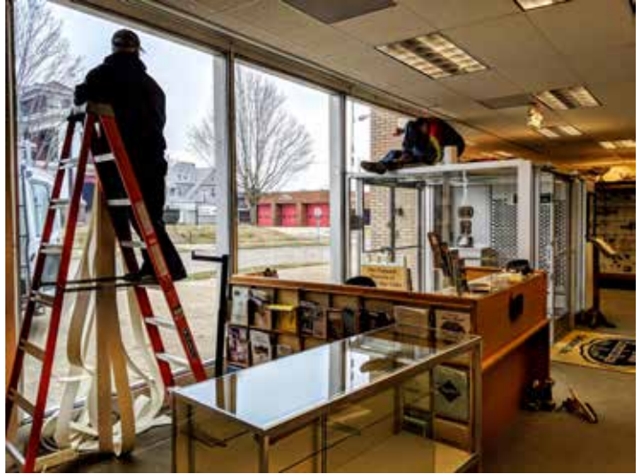
The new blinds on the front of the museum were installed by Modern Glass employees. As they were taking the old blinds down they disintegrated with pieces of plastic everywhere.