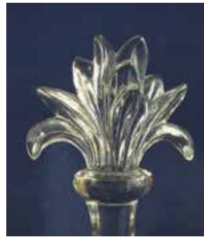
Original Center Finial