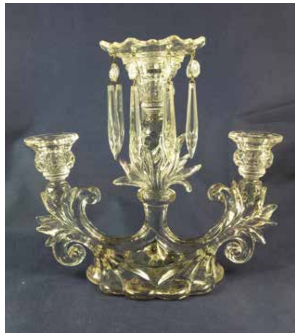
Unknown early version, 3-light candlelabrum