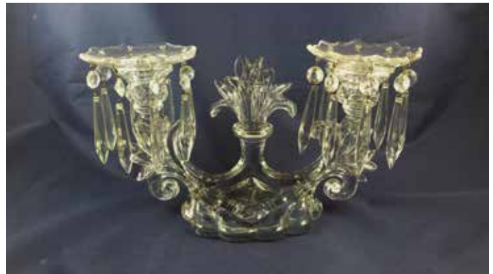
1356 2-light candlelabrum, early version