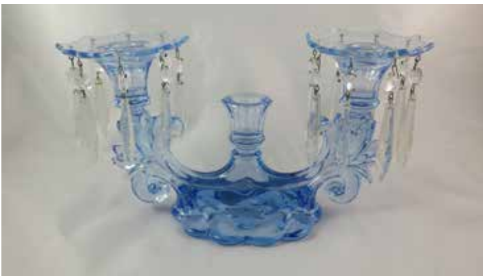
1358 3-light candlelabrum, revised version