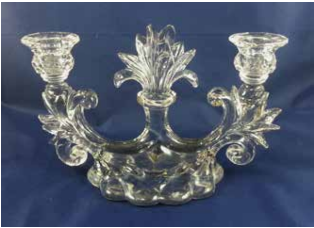
1355 2-light candlestick, early version