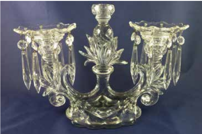
1358 3-light candlelabrum, early version