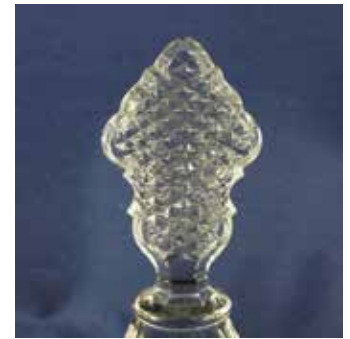
Center Finial Redesigned

There are two main changes that occur, with other minor ones that won't be mentioned here. The most noticeable change is the center finial. A plausible explanation for the change is that they had trouble with the original version coming out of the mold. The second feature that changed is the candle cup. The original design is much more detailed and, in my opinion, more beautiful. I wonder why they didn't keep it.