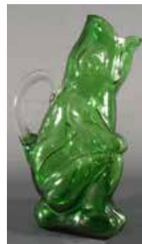
#1352 30 oz Handled Frog Vase

In an effort to make the meetings accessible to more members, we moved the starting time later by one hour. Please plan to join the meeting about 10-15 minutes early to make certain the technology is working correctly. ■