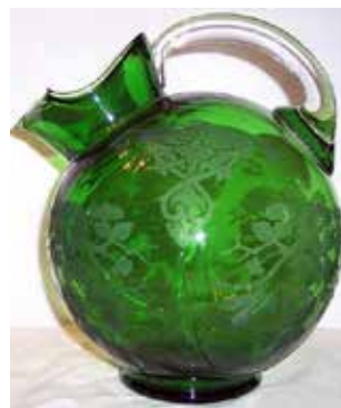
#3400/38 80 oz Ball Jug E744 Apple Blossom