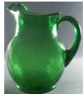
#1206 76 oz Jug Spiral Optic