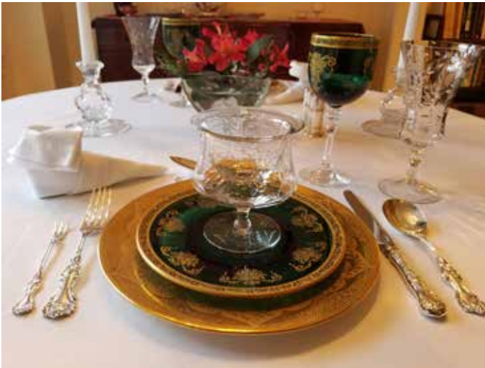
A holiday table set with 3500 stemware engraved Croesus

NCC is saddened to learn of the recent passing of Linda Adkins member #4280 since 1988. We send our thoughts and prayers to the family.