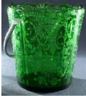
#851 Ice Pail E754 Portia

At the December “Zoom & Tell” meeting, nearly 50 members gathered on a Zoom meeting to share their favorite pieces of Forest Green glass. Collectors from Texas, Wisconsin, Minnesota, Michigan, Missouri, Ohio, Arkansas, South Carolina, New Jersey, Virginia, New York, California and Rhode Island were educated about the production and variety of the Forest Green glassware produced by the Cambridge Glass Company.