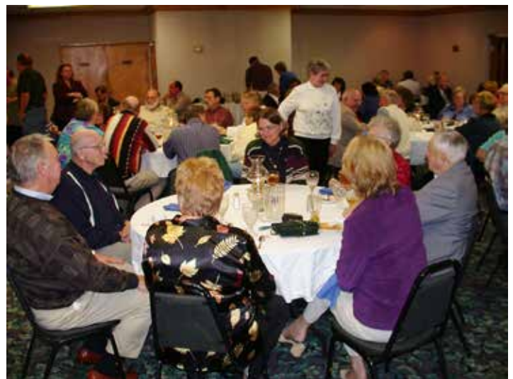
Some of the members attending the November 2004 meeting