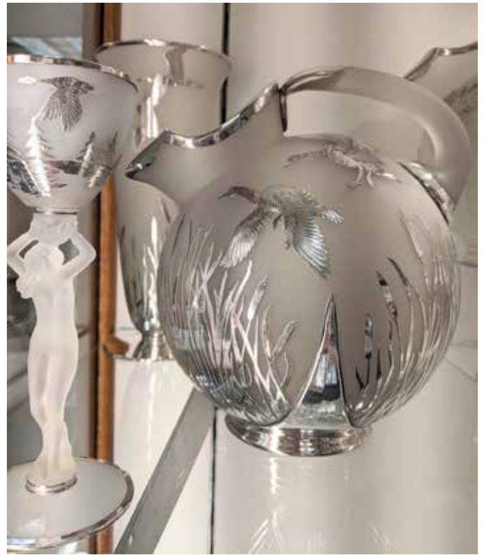
Silver overlay pieces look wonderful under the new lighting.