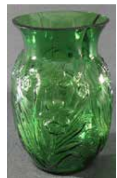
Everglade #21 7½ Vase