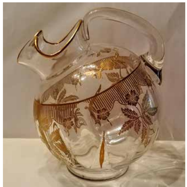
3400/38 80 oz Ball Shaped Jug with Lotus Decoration #888