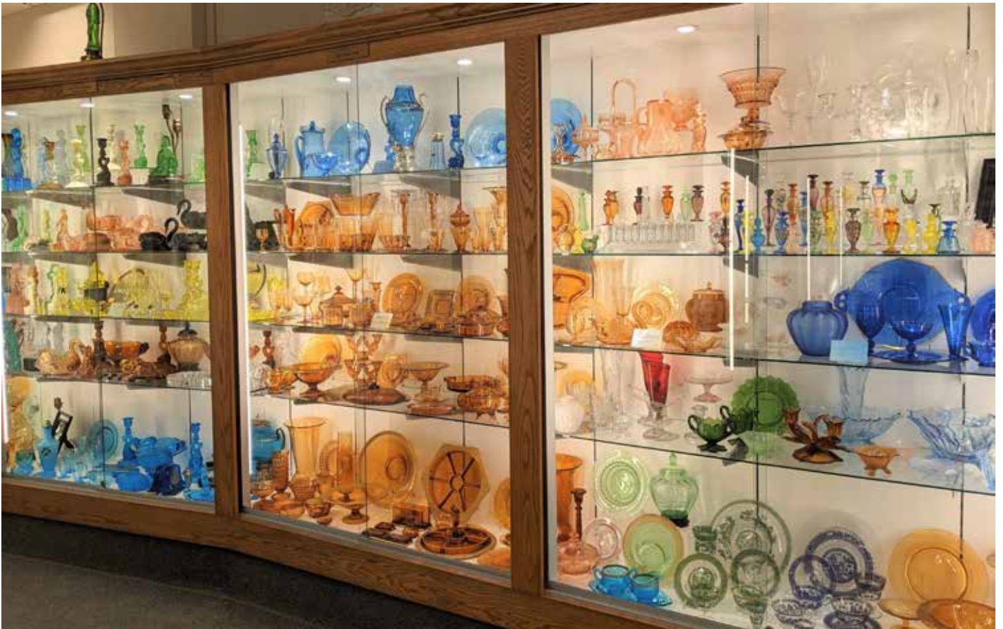
View of three cases with the new lights installed