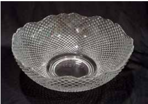
Mt Vernon 120 10½ in. Salad Bowl