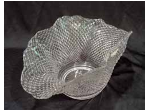
Mt Vernon 118 12 in. Oblong Bowl, Crimped