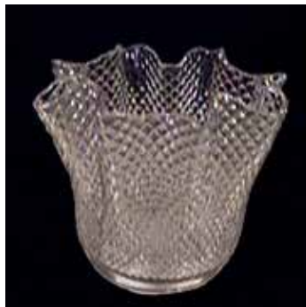
Mt Vernon 119 6 in Bowl or Vase, Crimped