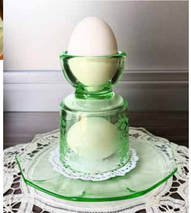
A very hard to find Cambridge #748 5 oz. Double Egg Cup in Light Emerald, etched Apple Blossom is now on display at the museum.