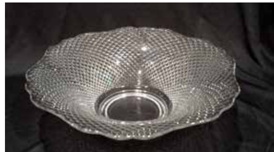
Mt Vernon 121 12½ in. Flared Bowl