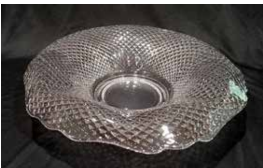
Mt Vernon 117 12 in. Rolled Edge Bowl, Crimped