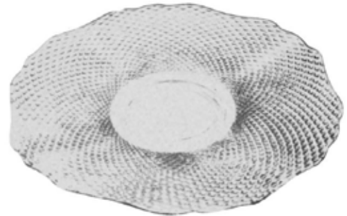
Mt Vernon 123 14½ in. Plate

Question for you: What other examples can you find of items from the same mold?