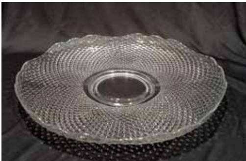
Mt Vernon 122 13½ in. Cabaret Plate