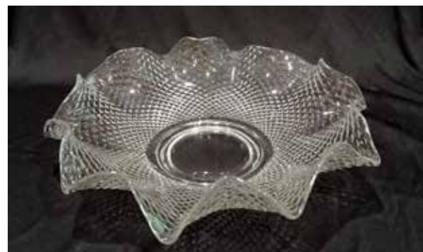
Mt Vernon 116 13 in. Shallow Bowl, Crimped