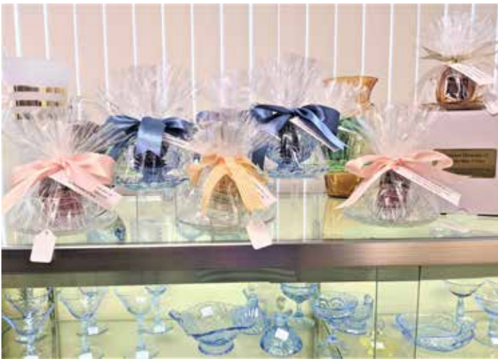
The Cambridge cup & saucer sets are popular in the museum gift shop. NCC member and museum volunteer Sally Slattery always makes the sets very eye catching and appealing to shoppers.