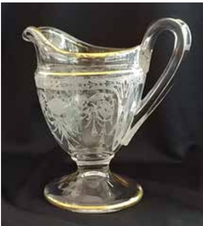
1917/20 - 6 oz. Cream and Sugar, etched Dresden

Crockery & Glass Journal, July 28, 1921 Page 64