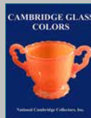
Cambridge Glass Colors

The following books can be purchased on Amazon and downloaded to your Kindle device