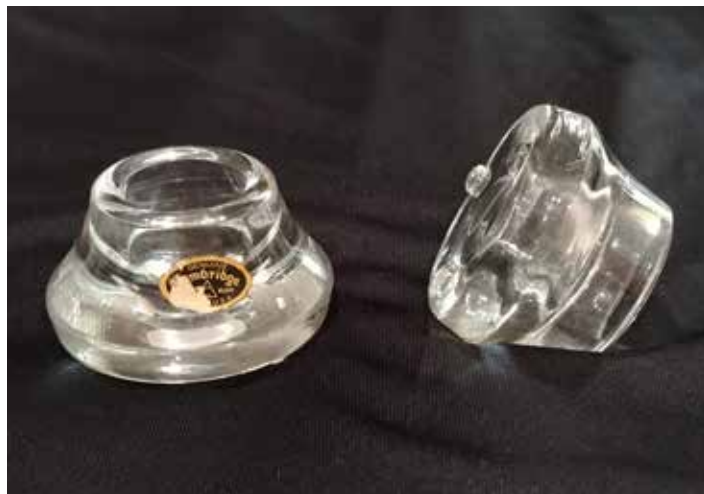
#1050 Candle Holder for #1041 4½ Swan