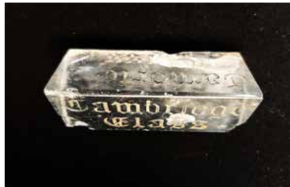
Dealer Prism Sign - double struck