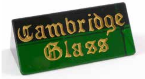
1015 - Dealer Prism Sign, Forest Green, Gold Encrusted