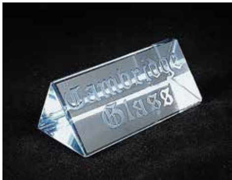
1015 - Dealer Prism Sign, Willow Blue