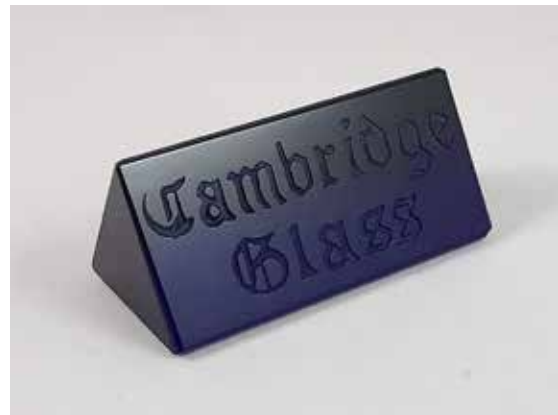
1015 - Dealer Prism Sign, Royal Blue