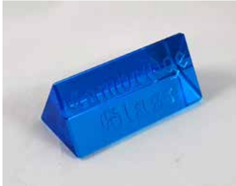
1015 - Dealer Prism Sign, Bluebell