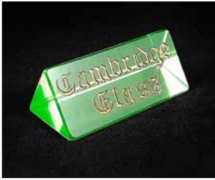
1015 - Dealer Prism Sign, Light Emerald, Gold Encrusted