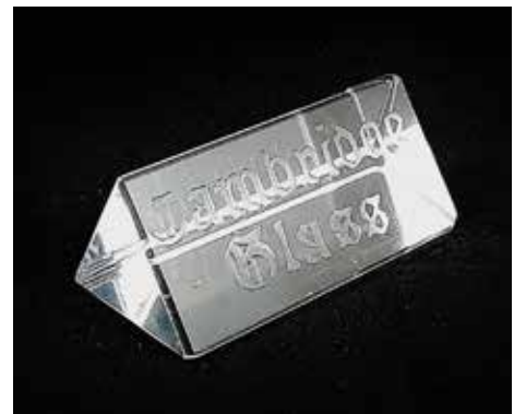
1015 - Dealer Prism Sign, crystal