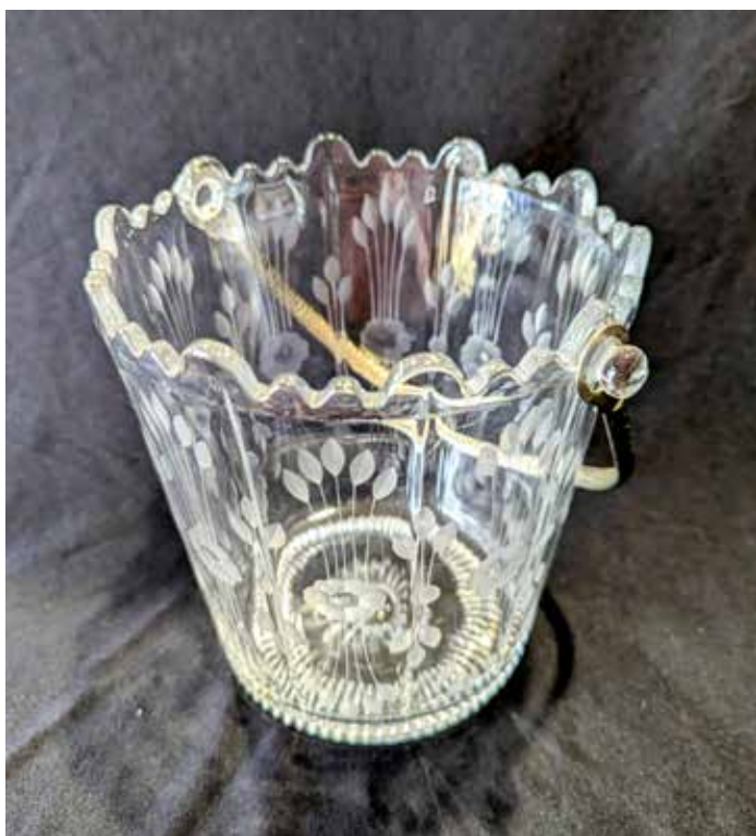
3600/674 Martha Ice Pail, Engraved #995 Lyric