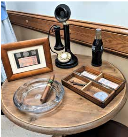
Part of the new Restaurant exhibit displays original Cambridge Cafeteria tokens and tickets.