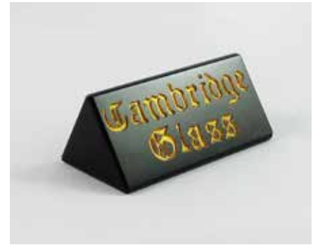
1015 - Dealer Prism Sign, Amethyst, Gold Encrusted