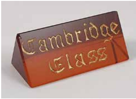
1015 - Dealer Prism Sign, Amber, Gold Encrusted