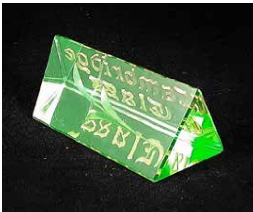
1015 - Dealer Prism Sign, Light Emerald, Gold Encrusted, Gray Cutting