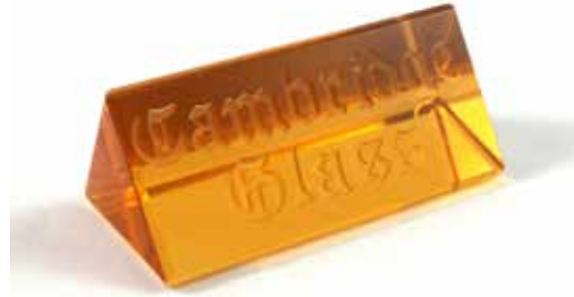
1015 - Dealer Prism Sign, Madeira