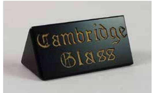
1015 - Dealer Prism Sign, Ebony, Gold Encrusted