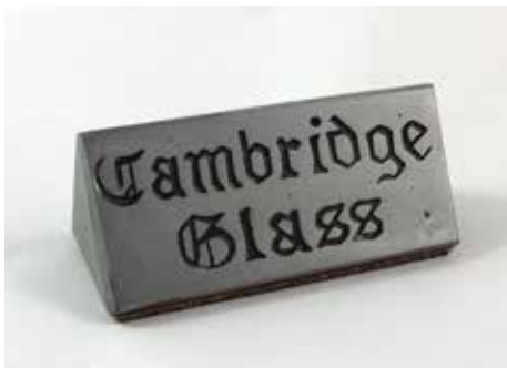
Dealer Prism Sign, Metal Reproduction