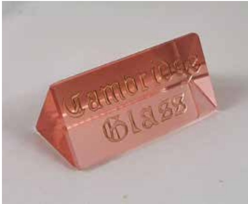
1015 - Dealer Prism Sign, Peach-Blond